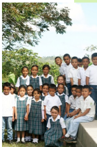
All the children at Jardin de Gracia live within walking distance