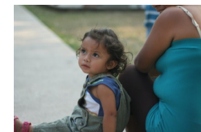
Jardin de Gracia impacts the community of El Socorro in so many ways. Our hope is that the children that graduate, become beacons of hope in this poor village.