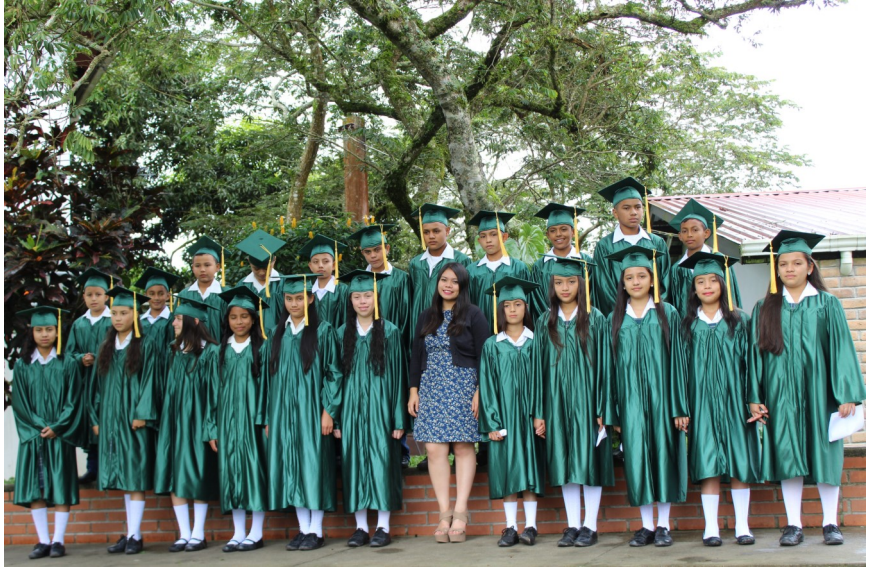
Sixth Grade class of 2017